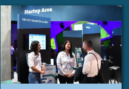
Startup Special Package*