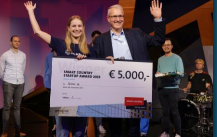
Startup Award Sponsoring

As a sponsor of the Smart Country Startup Awards, you will be on stage and can present yourself to the startup scene as an innovative company.